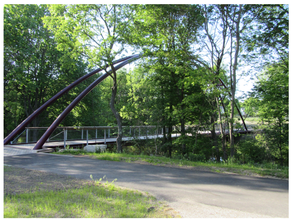
Neponset Trail Harvest River Bridge over the Neponset River

For more information, go to http://www.neponsetgreenway.org