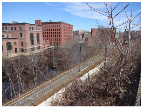
Neponset Trail and Baker Chocolate Factory from Eliot St.