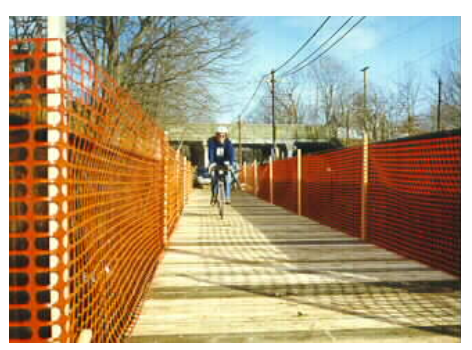
Volunteer-built trail bridge (December 1997)